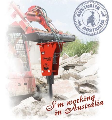
I'm working in Australia

Tested in rough Siberian and African conditions, this series give You proven reliability, ultimate power and productivity. The bottom housing is made from special wear resistant casting steel, it provides additional protection for the main body even after "blank firing".