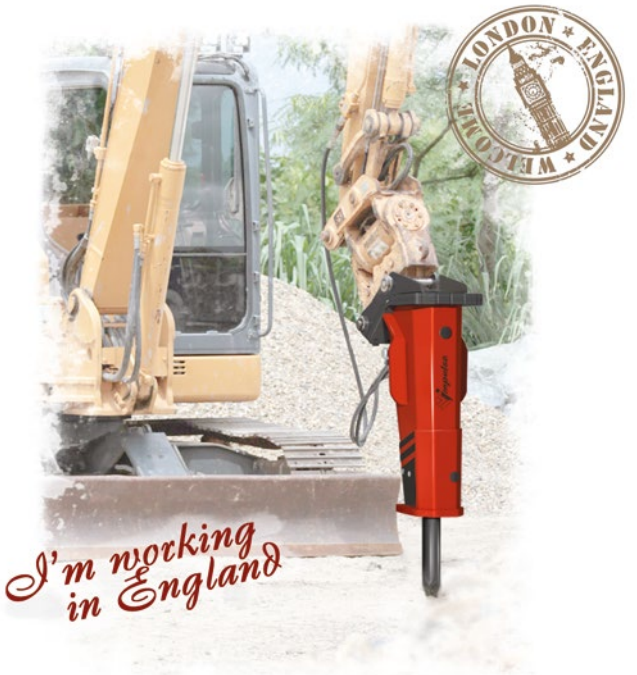
I'm working in England

The breaker provides maximum concentration of power for its minimum weight. Easy-to-change single bushing and cylinder linear make Impulse breakers easily repairable in the field, special tools are no longer required. Conical lower section provides better penetration. The construction without any through bolts prevents any problems with "blank firing".