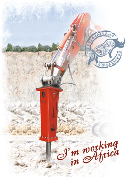
I'm working in Africa

The enlarged gas camera provides better productivity even for lighter excavators. Additional outside changeable buffer protects the housing from damages during heavy operations. The single bush-box is easily dismantled with just four bolts, so there is no need for a heavy press. The main body, with its no-bolt design, decreases the damage risks after "blank firing".